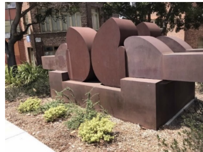
4. LOOP IV (Stiff Loops), Gerald Walburg, 1974