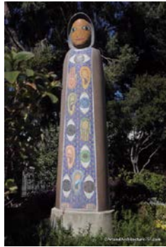
1. Madonna, by Benjamin Bufano, 1974