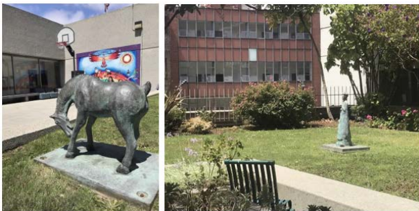
5. Reproductions of historical Chinese bronze sculptures