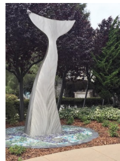
8. Fish Tale, Hilda Shum, 1995